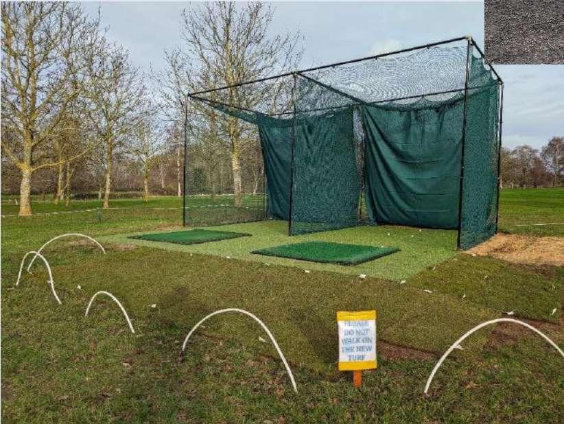
The two new practice netts are finally in use (and survived one storm) and we please ask that you don't walk on the new turf until it has had time to root.