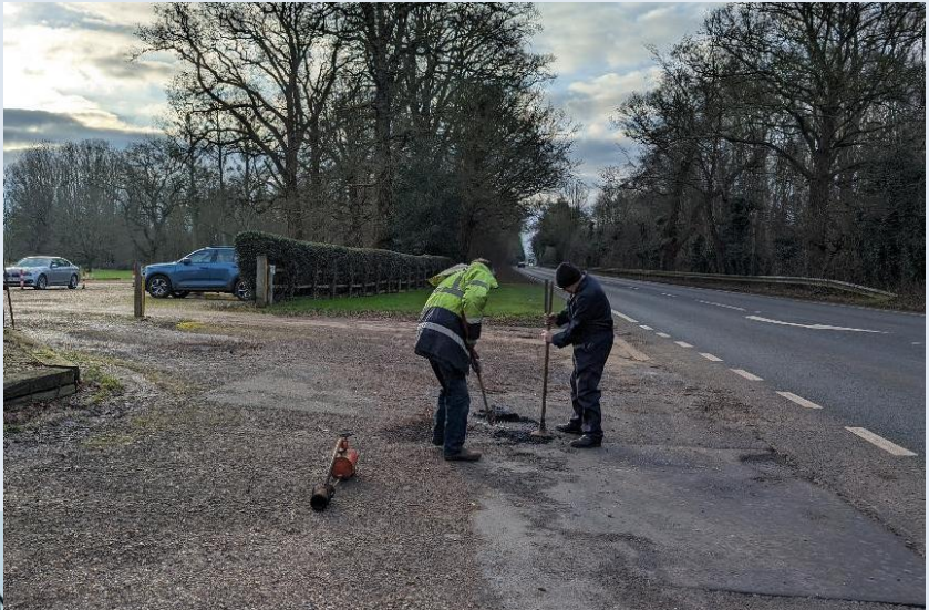
The pot holes near the entrance have just been filled in thanks to Ryston's own highway operatives, Roger and Eric.